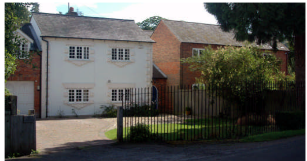
Old school house at Stonor

Stonor once had its own school, Post Office with village store and an inn, the Stonor Arms. These are all now closed.