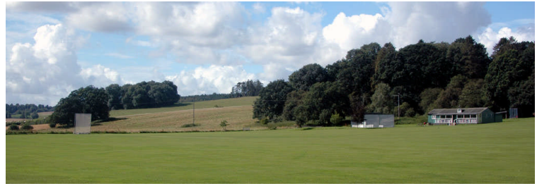
Stonor Cricket Club's ground opposite Stonor Park

Between Stonor and Middle Assendon the B480 road that follows the valley forms the boundary between Oxfordshire and Buckinghamshire.