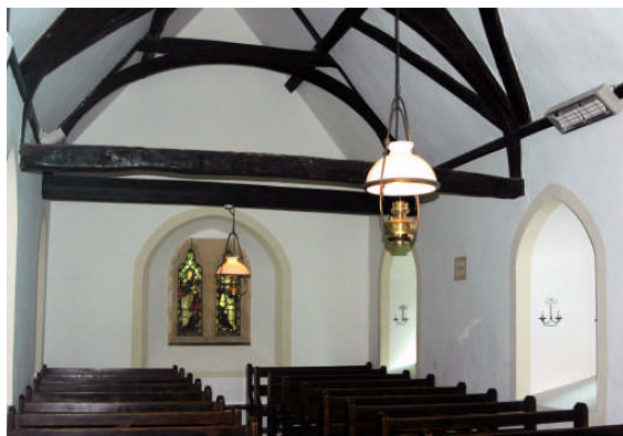
Simple pews in the north aisle