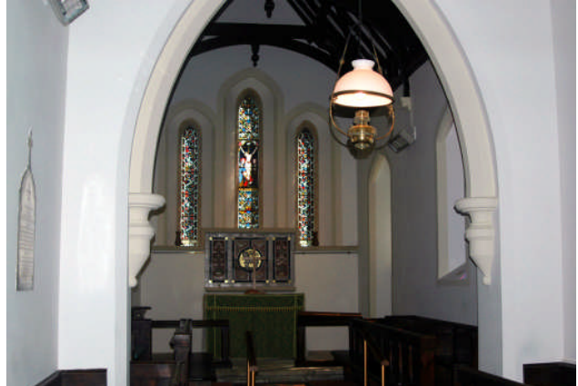
View of the chancel arch and altar