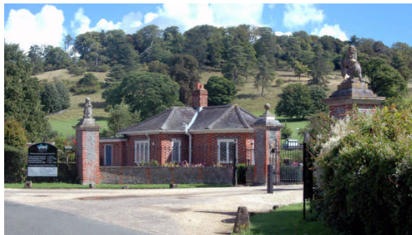
The entrance to Stonor Park

Stonor Park is the location of Stonor House. Lord and Lady Camoys and the Stonor family have owned the house for over eight centuries. The Catholic chapel has been in constant use, including during the Reformation. As the estate workers were expected to be Roman Catholic, no Church of England chapel was built for Upper Assendon, the nearest church being at Pishill.