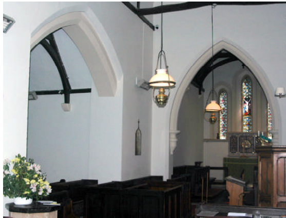
The interior 'split' of Pishill church: north aisle to the left and chancel to the right