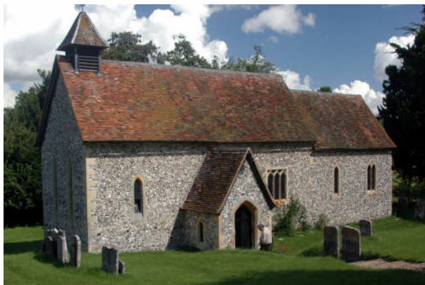
The flint and stone Pishill church showing the south porch

The church is located at the top of Church Hill, a small steep hill to the south of the village.