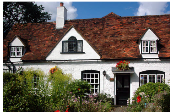
The Rainbow public house, Middle Assendon