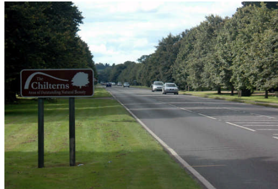
The Fair Mile

Almost at the end of the Fair Mile there is a bend before it reaches Northfield End. It is here that there is one final item of interest.