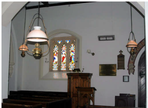
The view when seated in the north aisle