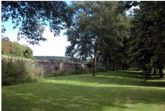
The deer park wall

In 1977 a further avenue of trees was added to the Fair Mile to commemorate the Silver Jubilee of Queen Elizabeth II. This second row is of Lime trees.