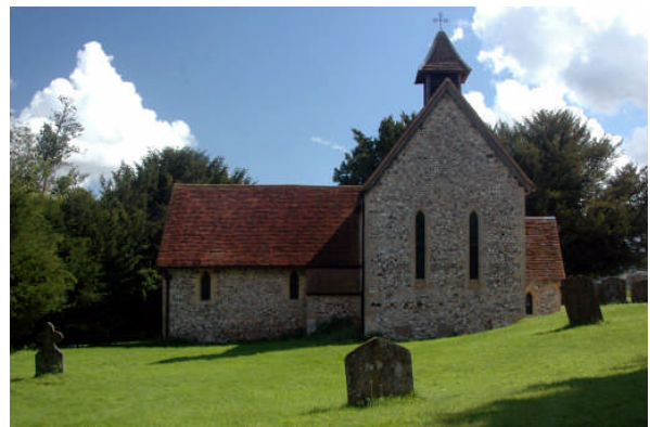
Pishill church from the west, showing the north aisle

An unusual feature of Pishill church is its north aisle. Sitting in the pews in this area it is possible to see the pulpit but not the altar. It is also known as the Stonor aisle and may have allowed the Roman Catholics from Stonor to use the church after it became protestant.