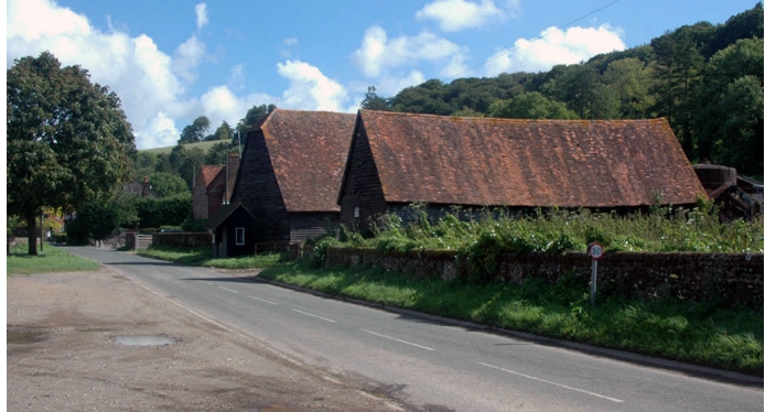
Upper Assendon Farm in the present day village of Stonor

Stonor Park is the location of Stonor House. Lord and Lady Camoys and the Stonor family have owned the house for over eight centuries. The Catholic chapel has been in constant use, including during the Reformation. As the estate workers were expected to be Roman Catholic, no Church of England chapel was built for Upper Assendon, the nearest church being at Pishill.