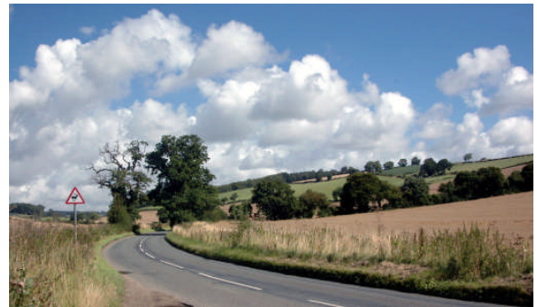
The B480 in the Assendon valley between Stonor and Middle Assendon